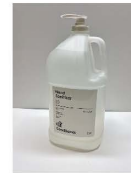
Hand Sanitizer Gallon $22/per gallon (Includes Pump)