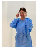
Level 2 Disposable Isolation Gown (SMS) $7/ea 3 case min 80 gowns per case of same size (can mix & match if we have stock) Currently have: 10 Medium in stock/$70 11 Large in stock/$77 *after current stock is gone 3 case min will apply