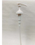
Spare Pump (For Gallon Only) $4/ea

W.H. Cooke & Co., Inc. 6868 York Rd, Hanover, PA 17331 717-630-2222