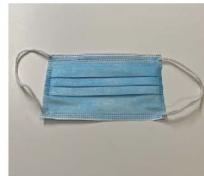
Disposable Face Mask $15/50 pc