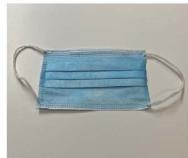
Disposable Face Mask Made in USA $.99/ea