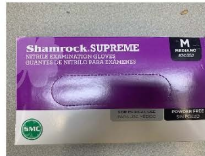
Nitrile Gloves Medium 4mil $230/case of 1000