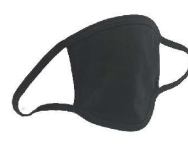
Cloth Mask Make in USA $40/pk of 10