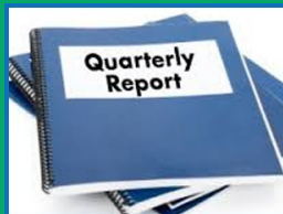
Quarter in Review Page 2