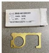
No Touch Door Opener $10/10 pc