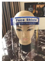
Face Shield $20/10 pc