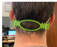
Mask Strap $15/10 pc