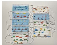
Children Disposable Face Mask $20/pk of 50