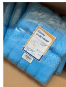
Shoe Covers $.37/ea

W.H. Cooke & Co., Inc. 6868 York Rd, Hanover, PA 17331 717-630-2222