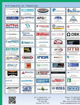
Product Lines Page 3