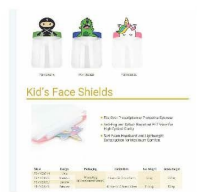
Kid's Face Shield $20/10 pc