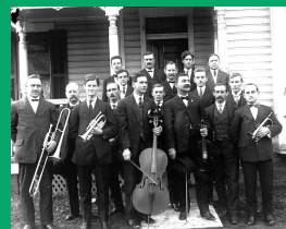
In The Community- Glen Rock Carolers (1908 Carolers picture above) Page 6