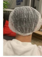
Hair Net 24in $.26/ea