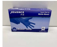
Nitrile Gloves XL 4mil $230/case of 1000