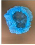
Hair Net 21in $.25/ea