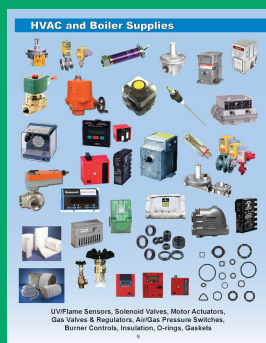
Boiler & HVAC Page 4