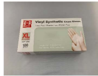
Vinyl Gloves L & XL $150/case of 1000