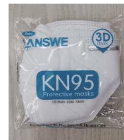
KN95 $55/20 pc