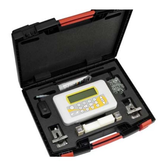
The Portaflow 220 Standard equipment is supplied in a rugged polypropylene carrying case fitted with a foam insert to give added protection for transportation.