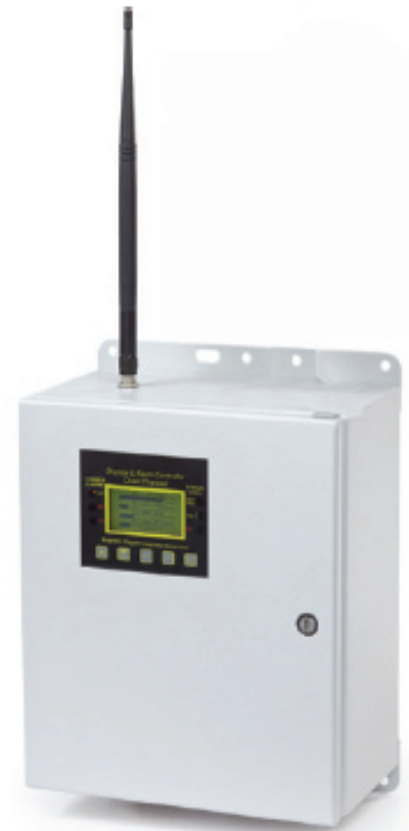
Available in NEMA 4X non-metallic, painted or stainless steel and NEMA 7 explosion proof wall mount

Unlike mesh networks and other systems designed for short range applications, the C2/TX utilizes Frequency-Hopping Spread Spectrum (FHSS) modems that offer higher power, longer range and lower susceptibility to interference. An optional multi-interface board supports an RS-232 or RS-485 wired serial port for remote MODBUS access, a solid-state data logger with USB interface, a second 900 MHz or 2.4 GHz radio for dedicated wireless remote access as well as an 802.11 WiFi interface for access via smartphones or tablets. WiFi-enabled C2/TX controllers also feature an integrated web server that allows users to remotely view real-time data, historical information and current configuration. With the correct password, remote users can change system setup variables. Finally, an optional satellite / cellular modem enables remote access from anywhere in North America.