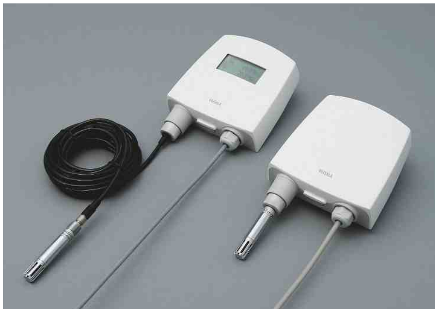
The HMT120/130 with and without a display.

The Vaisala HUMICAP® Humidity and Temperature Transmitters HMT120 and HMT130 are designed for humidity and temperature monitoring in cleanrooms and are also suitable for demanding HVAC and light industrial applications.