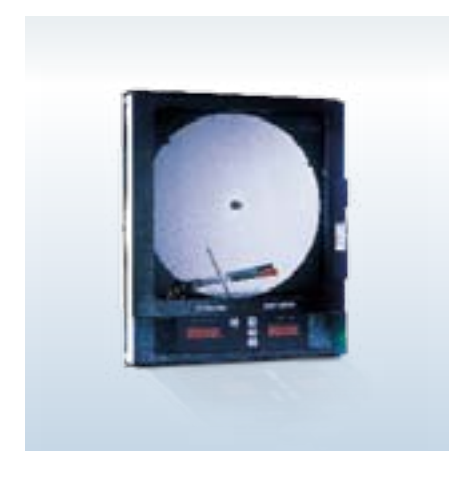
Chart Recorders: for hard copies of all process activities

West Instruments distributes a wide range of Partlow brand digital (microprocessor based) and analogue circular chart recorders. The range provides reliable operation in rugged environments – from light industrial through to extreme industrial wet applications to industry specific flow and relative humidity applications.