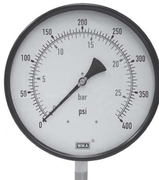
Bourdon Tube Pressure Gauge Model 211.11

Additional error when temperature changes from reference temperature of 68°F (20°C) ±0.4% for every 18°F (10°C) rising or falling. Percentage of span.