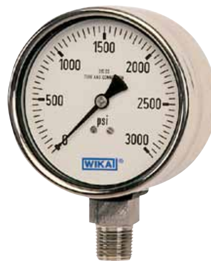
Bourdon Tube Pressure Gauge Model 232.30

Medium: +392°F (+200°C) maximum - dry +212°F (+100°C) maximum - liquid filled