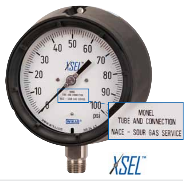
Bourdon Tube Pressure Gauge Model 232.34 NACE