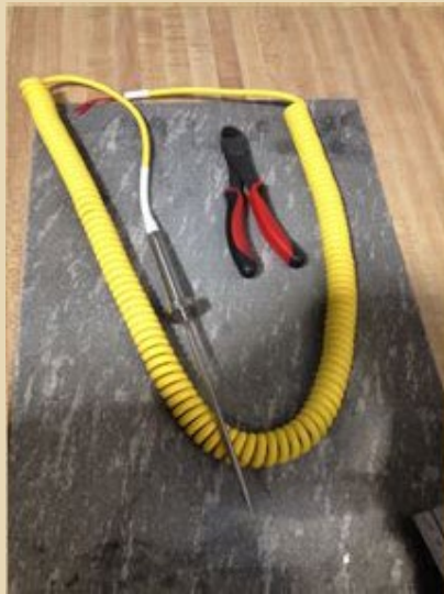
SP-1853 2252 Ohm Thermistor with S.S. handle

W. H. Cooke & Co. has several products tailored for Smoke Houses in the Meat Packing Industry. We custom fabricate thermocouple and RTD probes, supply socks for Wet Bulb/Dry Bulb systems as well as water proof data loggers. We can also cross almost any stitch probe needle for brine injection machines. Send us your inquiries.