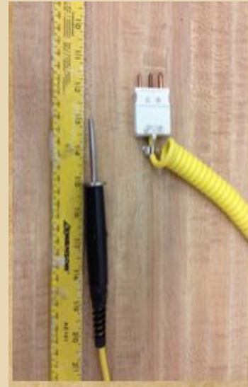
SP-1850 RTD for measuring temps in dog treats